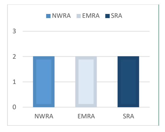
Figure 1 | OPR Submissions by Regional Assembly Area

OPR submissions during Q3 2024 related to all Regional Assembly areas. Figure 1 shows the number of submissions made on consultations within each regional assembly area.