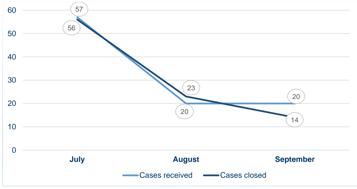
Figure 2 | Cases received vs. cases closed Q3, 2024

During Q3 , a total of 97 cases were received and 93 cases were closed by the OPR, detailed by month in Figure 1.